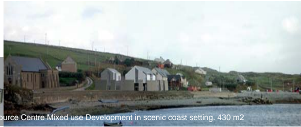
Clare Island Resource Centre Mixed use Development in scenic coast setting. 430 m2