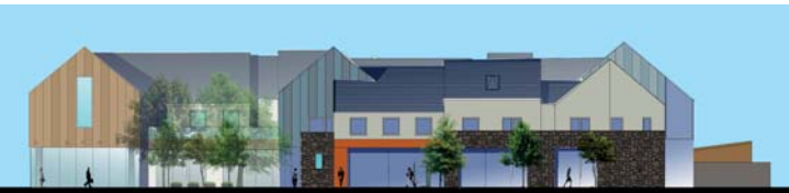
Clomboo town and village centre: Mixed used development inserted in traditional context. 3600 m2